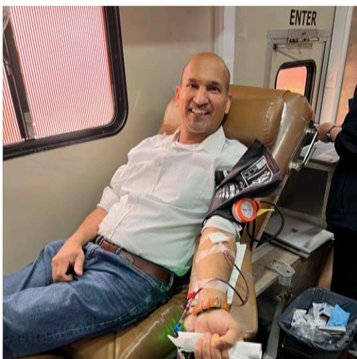
New Jersey Sant Nirankari Mission Saints donating blood and doing sewa in the kitchen.