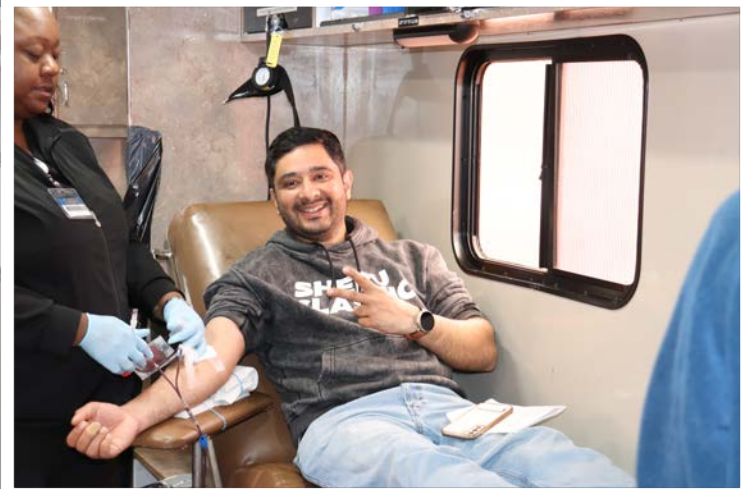
New Jersey Sant Nirankari Mission Saints donating blood.